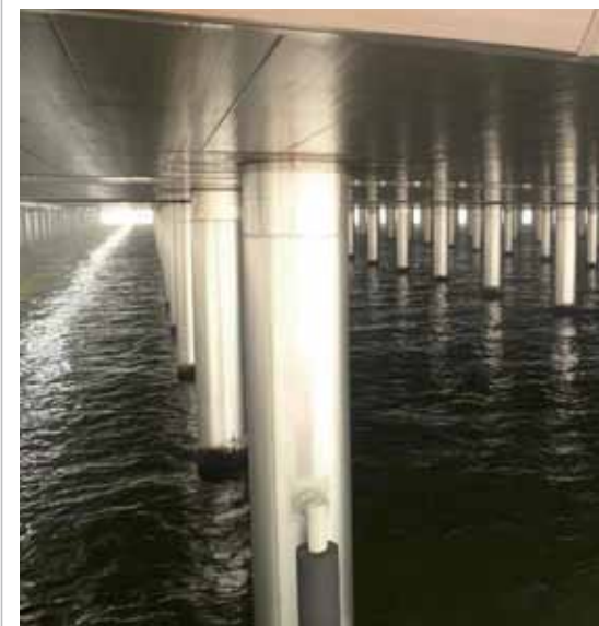
The highly corrosion-resistant marine structure of the Haneda Airport.

Chloride environments that exist, for example, in marine structures, or in flue gas desulfurization equipment in thermal power plants, or in soy source and salt manufacturing plants, are also very corrosive to conventional stainless steels. It is therefore with pride that Nippon Yakin Kogyo's staff relate that the company's high corrosion-resistance alloys are particularly applicable to these environments.