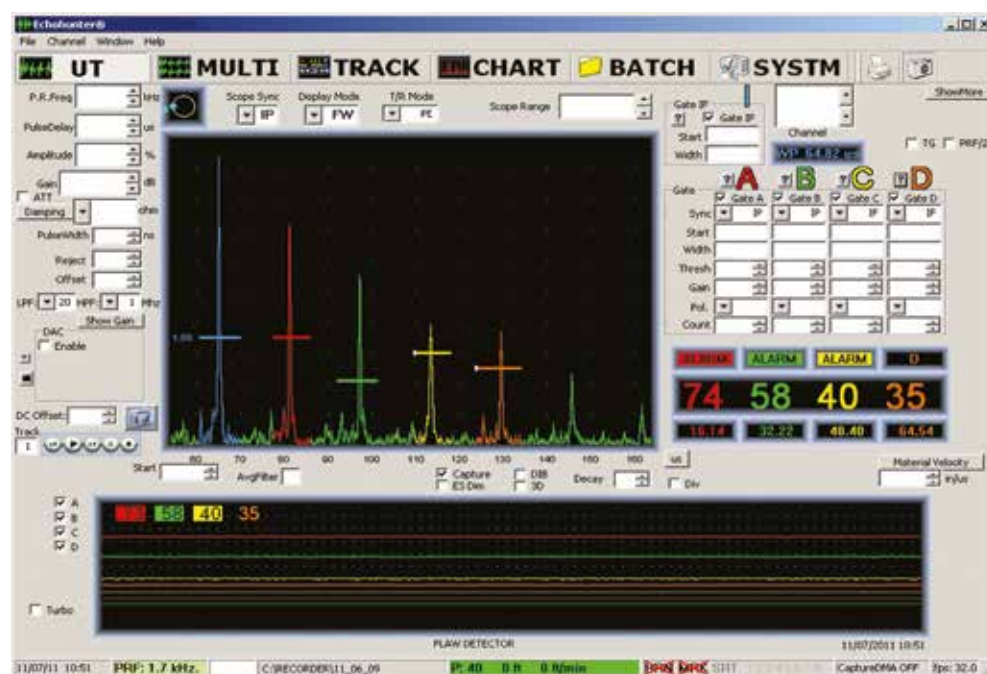
Echomac® Ultrasonic Electronics Software.

nondestructive tests. This increased the popularity of ultrasonic testing. It is also frequently used to measure a tube's wall thickness or the diameter of a steel bar. For material typical of OCTG, MAC has recently designed specialized mechanics that house ultrasonic transducers in unique test heads that can accommodate other technologies as well. The mechanics have currently been installed to inspect tube ends and spinning tubes of extremely large diameters.