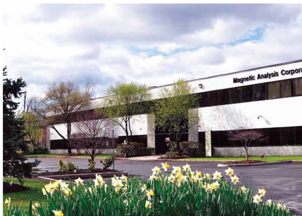
MAC's headquarters in Elmsford, New York.

MAC's core business centers on manufacturing NDT equipment. NDT includes any method of testing that does not change the characteristics of the actual material in any way. These are the preferred testing methods because the