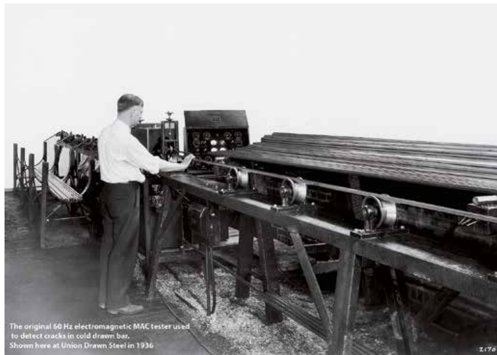
The original 60 Hz electromagnetic MAC tester used to detect cracks in cold drawn bar. Shown here at Union Drawn Steel in 1936.

In 2005, the American Petroleum Institute (API) revised some of its inspection standards, requiring certain material to go through at least two different